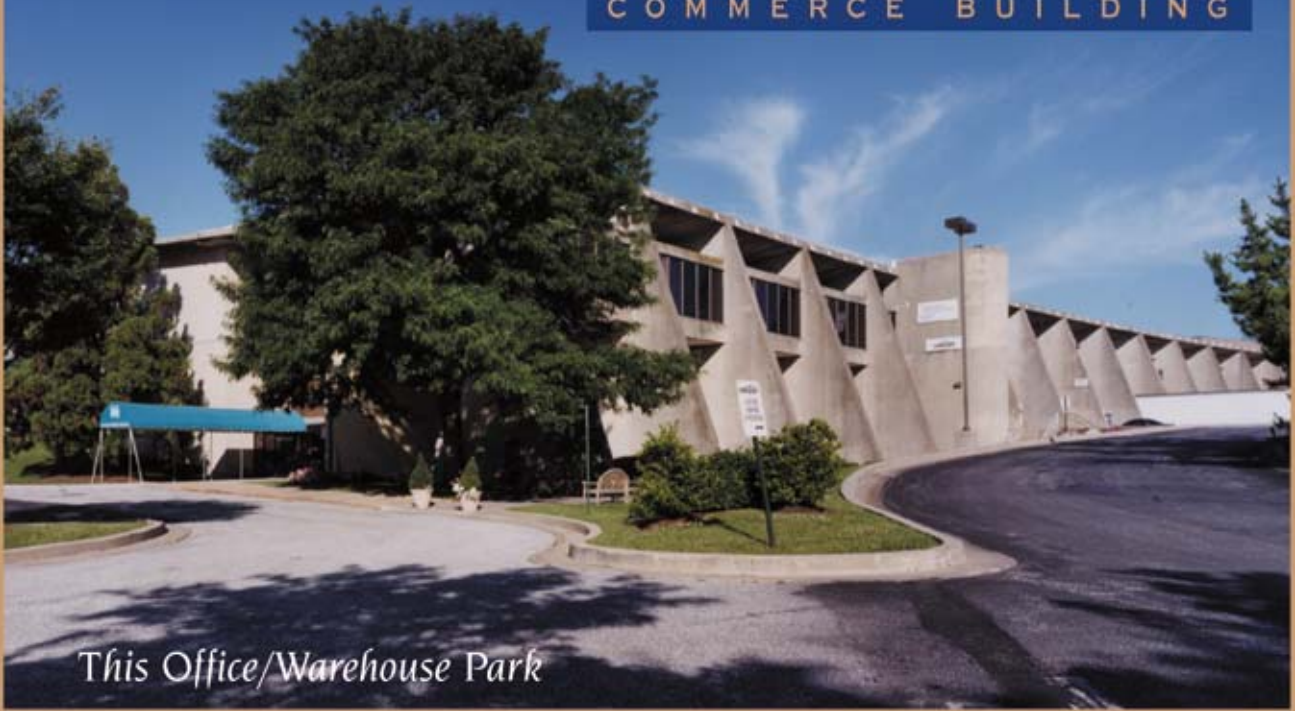
This Office/Warehouse Park

is located in Timonium in the heart of the Towson - Hunt Valley Business Corridor.